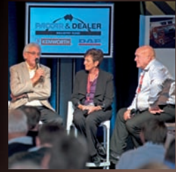
Kenworth Legends Luncheon