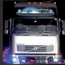
Volvo prime mover and CIMC trailer auction