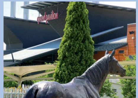
Exhibit at Convention

Rosehill Racecourse Parramatta in Sydney's west. 2012 is the first time ATC has been held in Sydney, centre of one of the country's largest concentrations of trucking operators, with a majority in a 20km radius of Rosehill Gardens Event Centre.